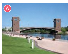
Fugan Canal Kansui Park