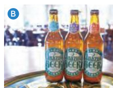
Unazuki Beer Hall