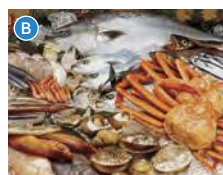
Ikuji Fish Station