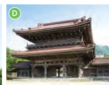
Inami Zuisenji Temple